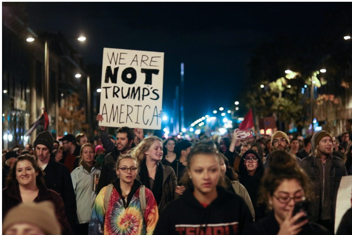
Temple Students Protest President Trump's Inauguration, Photo Courtesy Temple News