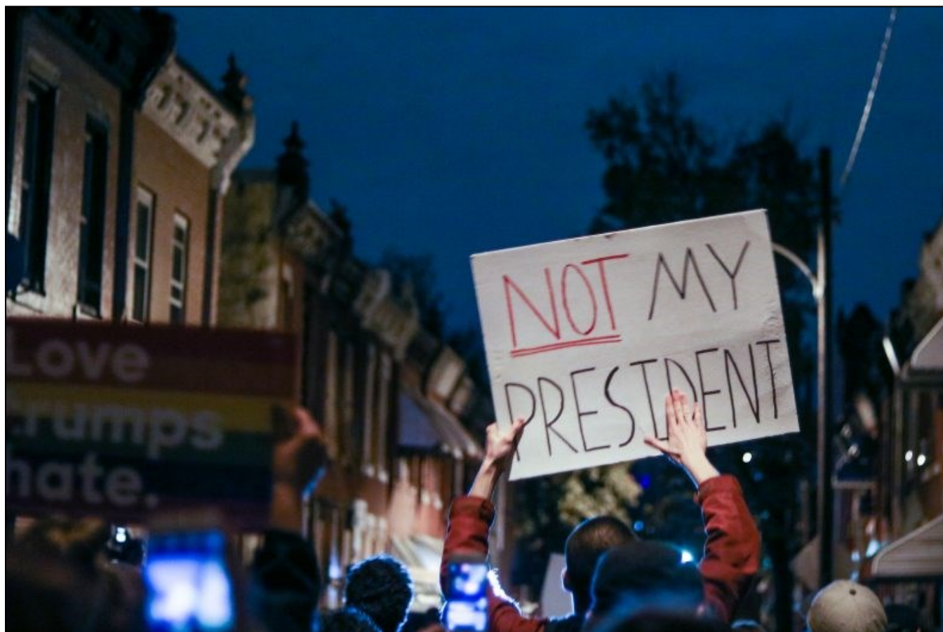
Temple Students Protest President Trump's Inauguration, Photo Courtesy Temple News