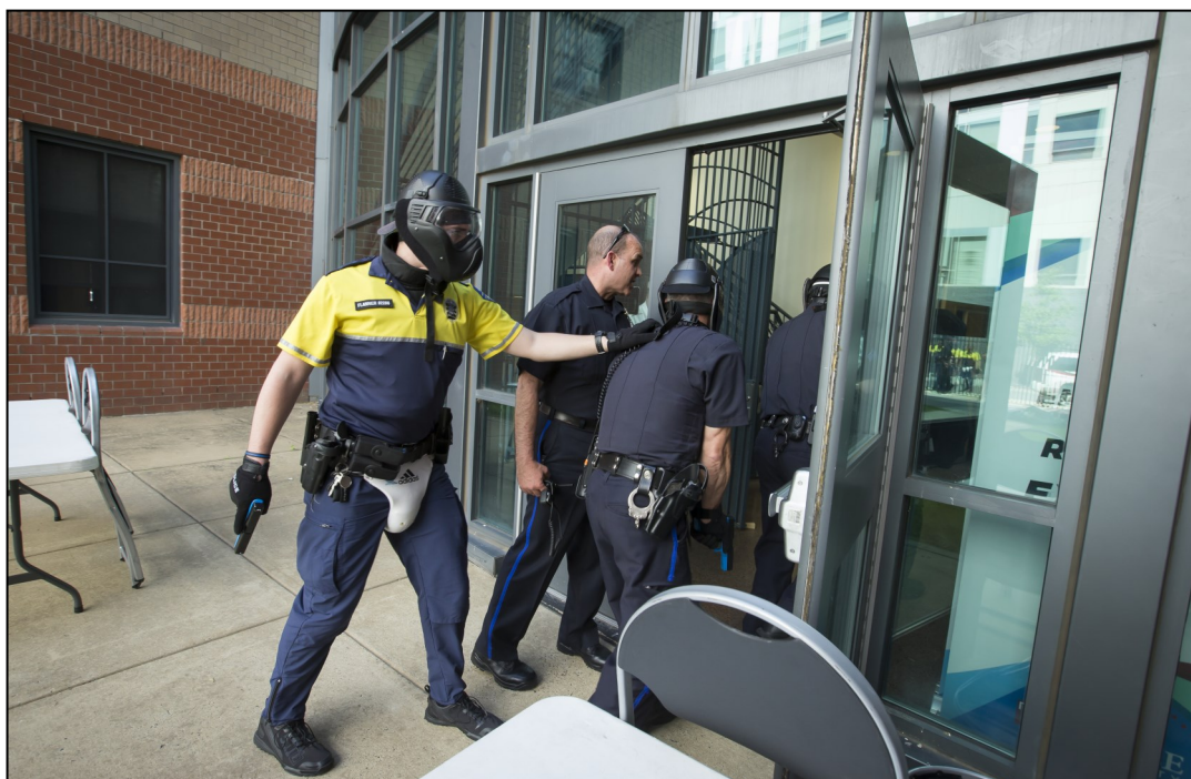
Photograph from an active shooter drill on Temple's Campus, June 2, 2016

PL: Thank you for your time; I am sure we will be talking again. ♦