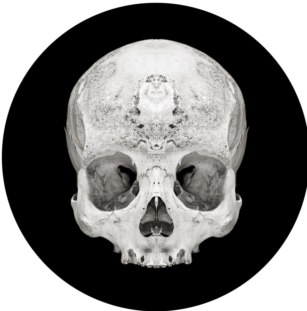
“Syphillis” from Orr's Exhibition, Perfect Vessels , at the Mütter Museum through January 5 th , 2017.

The idea of a skull as a container was something I began exploring almost as soon as the project began. Obviously, it is a jar for our brains. But I was also thinking of facial symmetry, then the classic image of the Rubin Vase (that is also two faces in profile). I began to think of vessels one sees displayed in museums: exquisitely crafted utilitarian objects now regarded as art. I saw how skulls are vessels for our consciousness (they are where we process the sensory information we collect, then build