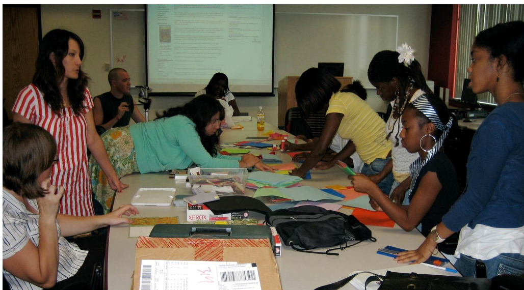
Temple Writing Academy, First Year

Recently NCW is pursuing a joint project with Tree House, Duckrey School, a local housing development company named Community Ventures, and the Philadelphia Water Department. Around the school building, Duckrey has a large expanse of pavement, mostly underused and in serious disrepair. This expanse could be redeveloped into a garden/ecology lab/recreation space that would also absorb rainwater runoff to the great benefit of everyone in 6-10 block radius. The cooperating partners have begun a Community Design Collaborative planning process with neighbors around Duckrey to design the new space. Our hope is that construction can start within 12-18 months and that, once completed, the garden will serve to enhance summer programming at Tree House, science education at Duckrey, and relationships between elders in the senior housing nearby and families living in the surrounding streets. New City approaches this effort as a literacy project, one that demonstrates how important local advocacy and partnerships can be in linking issues of education and quality of life. ♦