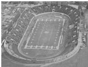
Temple Stadium, (date unknown)

In addition to the Owls football team, the stadium was used at various times by the Temple Owls Men's Soccer team, the Philadelphia Bulldogs, Philadelphia Spartans, and the Temple Owls Women's Soccer team. The Eagles used the stadium twice and in 1952 attempted to buy it from Temple. In 1968 it was the site of an international friendly game of the U.S. National Soccer Team and the Israel National Soccer Team. In 1970 it served as a venue for a concert including The Steve Miller Band, the Grateful Dead, and Jimi Hendrix .