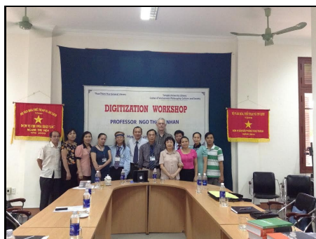
Digital Preservation Workshop in Huế