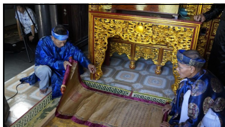
Community Elders Ceremonially Present Genealogical Scroll, Made of Silk