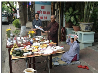
People Observing the Day of Spirits ( Ngày Cúng Âm Hồn )

An interesting detail: when doing field work in Vietnam, the team has to request permission not only from the local authorities but also from the spirits who have been guarding the documents, the temple, and the village. Hence, prior to the opening of the wooden box containing the royal decrees, elders of the clan organize a solemn ceremony at the clan temple, asking for permission from the ancestral and guardian spirits. ♦